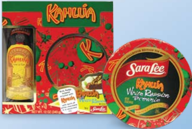
Holiday Retail Gift Pack