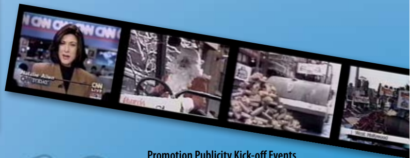
Promotion Publicity Kick-off Events

Vertical Marketing Network helped shake up Kahlúa with an innovative marketing plan to give the brand an improved relevancy with a new generation of consumers, while driving retail sales during the important holiday gift-giving season. From kick-off events generating tons of free exposure, to eye-catching merchandising materials and product packaging, to securing the perfect tie-in partner- Sara Lee, Vertical Marketing Network handled all aspects of this award-winning program. The results – the most successful promotion in the brand's history with a record number of off-shelf displays and a spirited sales increase of +24% versus prior year.